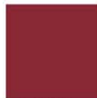
Dark red 3603 similar to RAL 3004