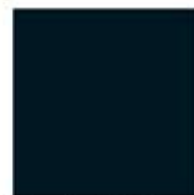
Deep black 7613 similar to RAL 9005