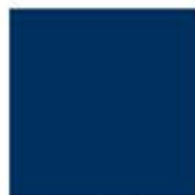
Dark blue 5603 similar to RAL 5008