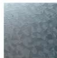
Patterned A (Austenit)