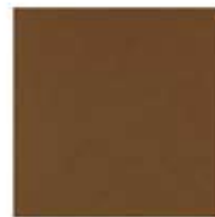
Copper brown 8307 similar to NCS S 4030-Y30R (metallic)