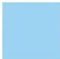
Lagoon blue 5408 similar to NCS S 1030-R90B