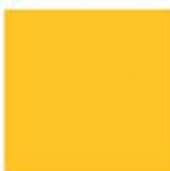
Corn yellow 1708 similar to NCS S 1070-Y10R