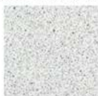
Granite white 9317P