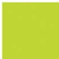
Lemon green 6715 similar to NCS S 1060-G60Y