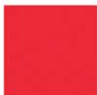
Tornado red 3508 similar to NCS S 0580-Y90R