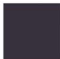
Graphite 7808 similar to NCS S 7502-B