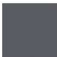
Quartz grey 7708 similar to NCS S 5000-N